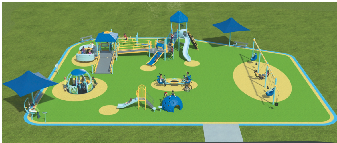
This graphic shows the design of the planned inclusive playground for Fairmount Park in Wheatfield. (Submitted)